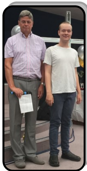
Governor Special Award 2018.

The photographs show some of the pupils receiving these awards. Well done to them all. At past award events, families have told us how very proud they are of their youngsters and how much it means to attend an awards event to celebrate success.