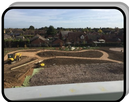
Forest School as viewed from the roof of main building