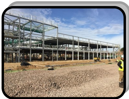
Right half of main building