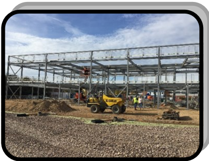
Left half of main building

As mentioned in the introduction, a few of the governors were delighted to be shown around the site of the new school. Much of the steelwork for the main building has been erected and the brickwork for the residential blocks has started. If work goes to plan the roof and flooring for the main building should be installed by Christmas making the building effectively watertight.