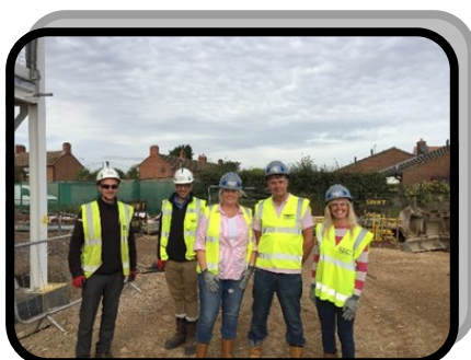
Three governors plus two of the site managers